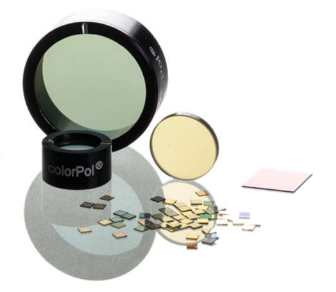
COIOIPOI° IR 1990 BC4 H I

(uncoated red, with AR-coating C1550 green)